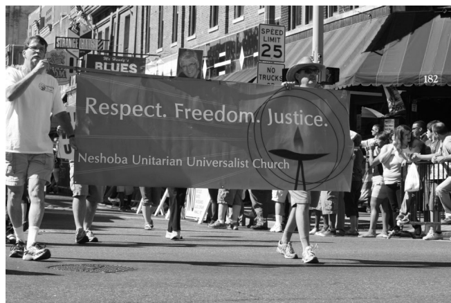
Neshoba Pride! Mid South Pride Parade (Memphis, TN) October 15, 2011